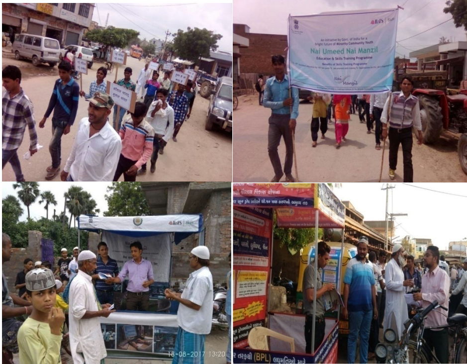
Awareness rally information kiosk installed during mobilisation of beneficiaries under Nai Manzil Scheme