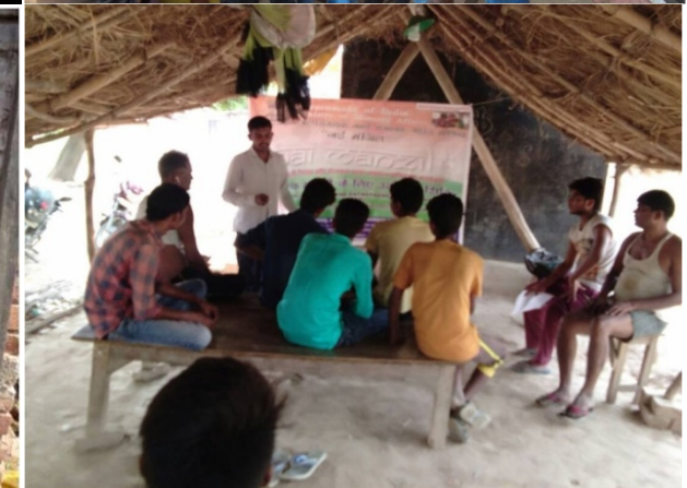
Awareness and beneficiary mobilization activities undertaken during the Nai Manzil Scheme implementation